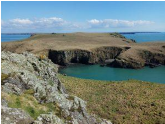
Skomer Island, West Wales

The Hub welcomed three members of the European Commission's SAM Secretariat to Cardiff on 27 th March. On 10 th April, we hosted a workshop on evidence review methods for SAPEA staff. A small group also enjoyed a weekend social excursion to experience Welsh wildlife and culture, at St David's and Skomer Island.