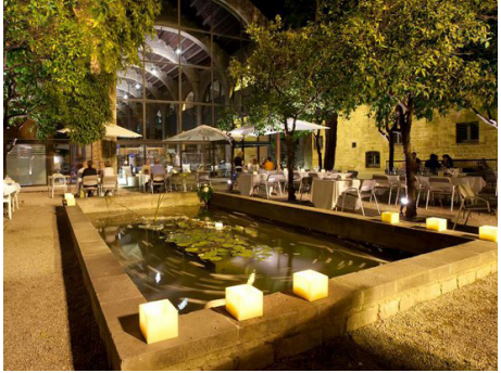
Norai Raval restaurant