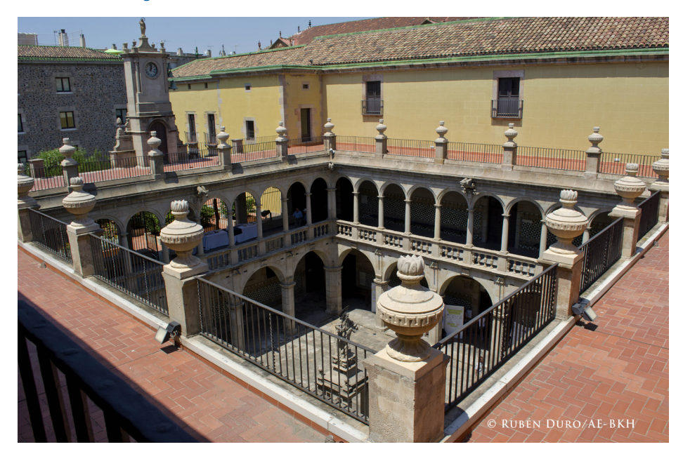
Institute for Catalan Studies (IEC)