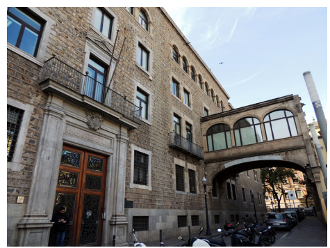
CSIC- Residència d'Investigadors, near the IEC